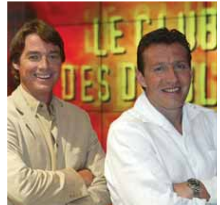
Club RTL is also a reference point for sports and is actively involved with the national football team 'Les Diables Rouges'

We also have a 49.9% stake in the Contact Group of music radio stations which broadcast to the north and south of Belgium and internationally. After reorganising its programme grid, the flagship station Radio Contact ended the year with an audience share of 14.0% (Autumn wave). The group restructured some of its radio services during the year – the multicultural station Contact Inter ceased broadcasting and Contact2's service to the north of Belgium also ended.