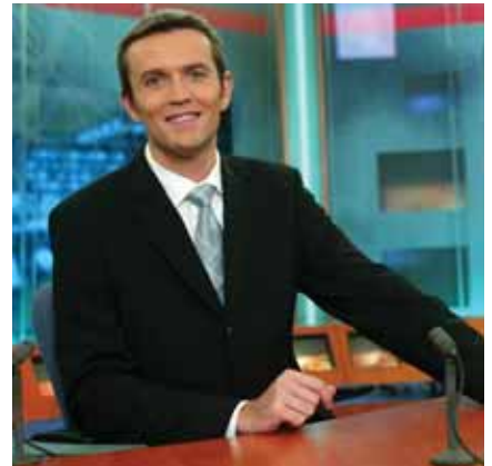
TVi's leading news show: Le journal de 19 Heures

Magazine programmes covering politics, science and social issues also scored well, as did the blockbuster films shown at 20.15 on Thursdays. The top three films of the year were Harry Potter à L'École des Sorciers , Astérix et Obélix Mission Cléopâtre and Le Journal de Bridget Jones .